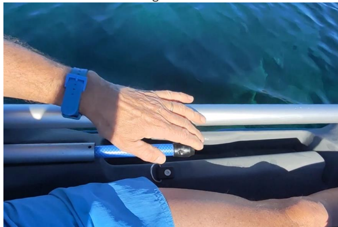
Steering control stick